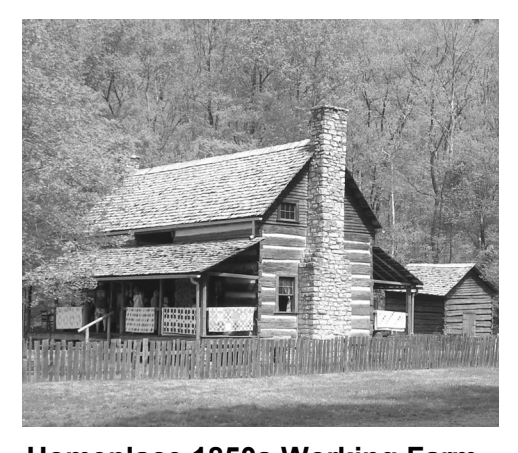
Homeplace 1850s Working Farm 8 Miles | 17 Minutes from Wranglers