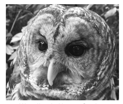
Woodlands Nature Station 18 Miles | 28 Minutes from Wranglers