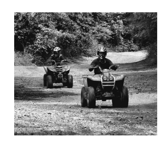
Turkey Bay Off-Highway Vehicle Area 7 Miles | 14 Minutes from Wranglers

What's Happening in Land Between the Lakes During Your Stay