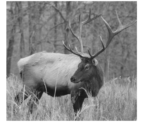
Elk & Bison Prairie 7 Miles | 14 Minutes from Wranglers